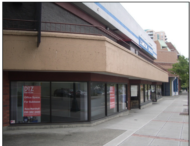
Office Space for Sublease

Permitted uses include business and professional offices, stores and shops for sale of goods, personal services, high tech and more.