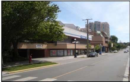
Wilson Centre - South Side