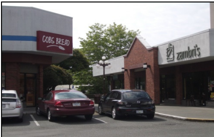
Cobs Bread and Zambri's Restaurant