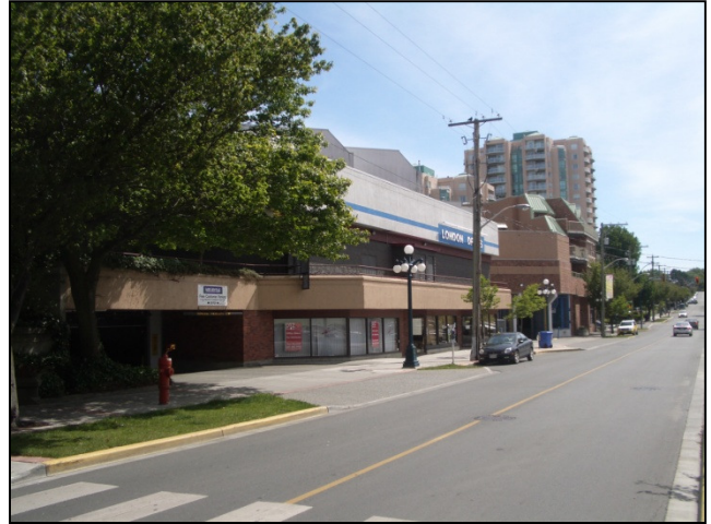
Looking East on View