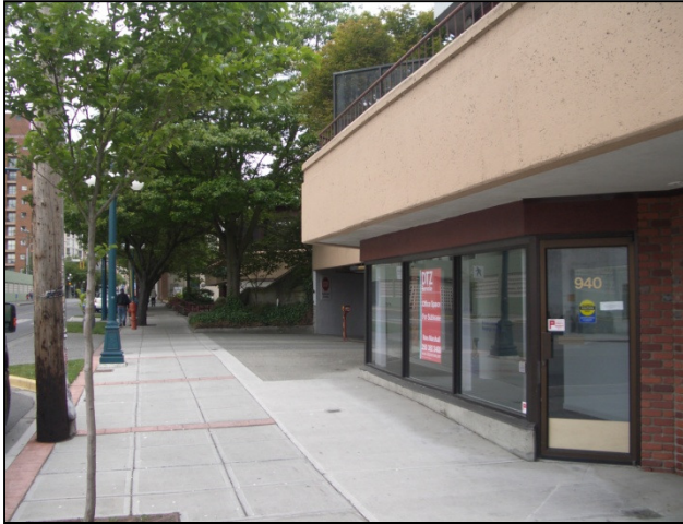
Looking West on View - Front Entrance