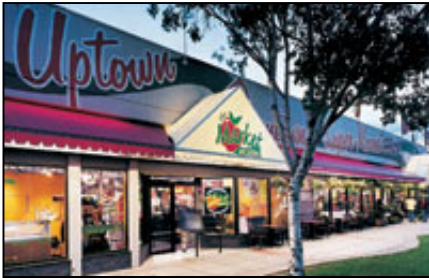
Market on Yates