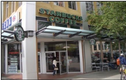
Starbucks & BCAA