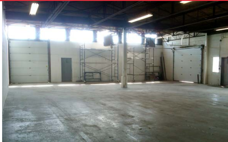
Unit 1 Warehouse Space