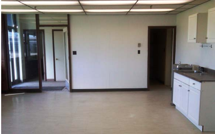
Unit 1 Office/Showroom